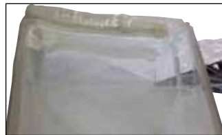
Zipper on top for easy disposal