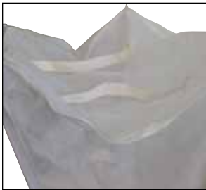
Handles for easy disposal